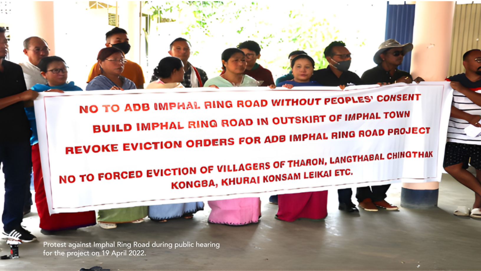
Protest against Imphal Ring Road during public hearing for the project on 19 April 2022.

Due to concerns of impacts, the Tharon Villagers also resolved to stand against the Imphal Town Ring road project in their village. The residents of Tharon village staged a sit-in protest at a community hall of the village against the proposed Imphal Ring Road project on 26 June 2021. Affected locals staged protest, raising demands, 'Government Should Respect Human Rights', 'No Road Through Our Home' etc. The Tharon villagers and the Langthabal Chingthak villagers, affected by the project, challenged the eviction orders and filed a petition with the Manipur High Court in August 2021, which passed an interim order on 10 September 2021 to suspend the eviction order till the next hearing.