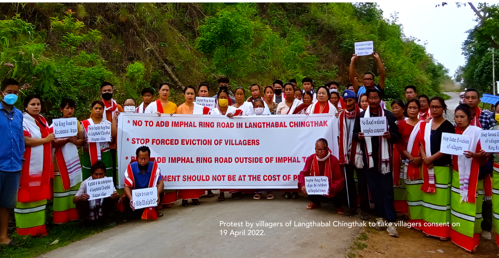
Protest by villagers of Langthabal Chingthak to take villagers consent on 19 April 2022.

The proposed project clearly failed to take the consent of affected indigenous communities of Kongba, Khurai Konsam Leikai etc. The Meitei people, indigenous to Manipur, will be most affected by the project in localities such as at Kongba Nandeibam Leikai, Khurai Konsam Leikai etc in Imphal East District. The Kabui people will also be affected by the project at Tharon and Langthabal Chingthak villages. Earlier, the Kabui people of Langthabal Chingthak raised concern with the project.