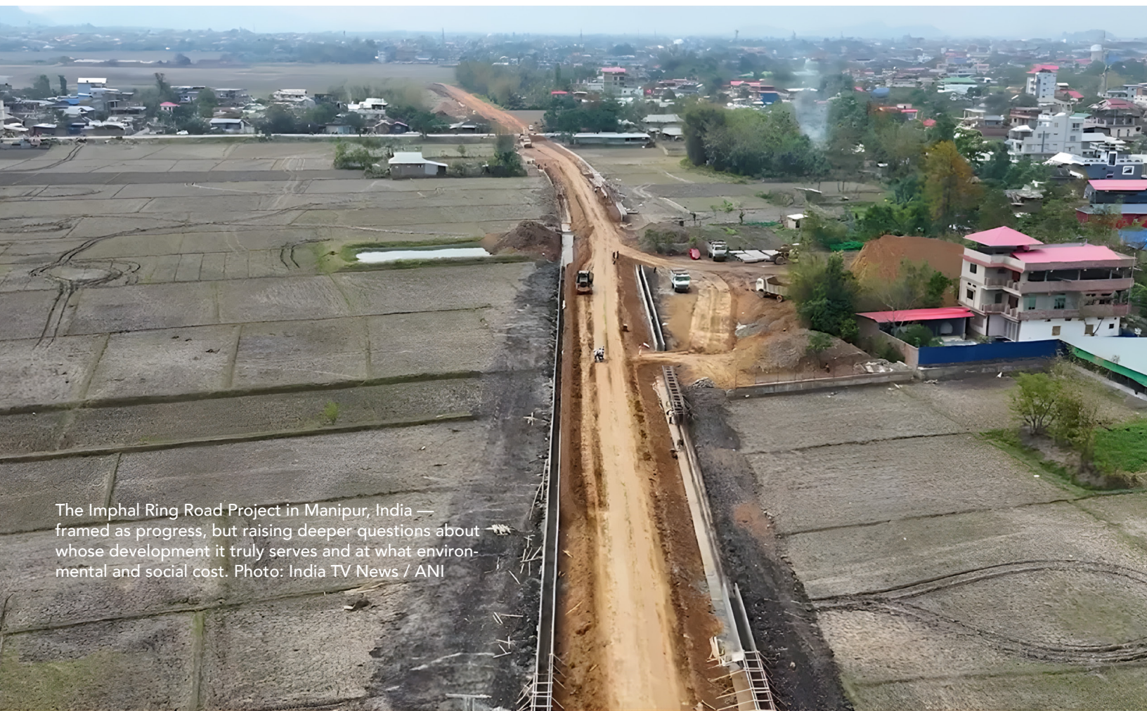
The Imphal Ring Road Project in Manipur, India — framed as progress, but raising deeper questions about whose development it truly serves and at what environmental and social cost.

The connection of several other National, State and International highways, viz, the Trans Asian Railway and Road project with the Ring Road project will add much pressure to the traffic volume to the road project. The proposed alignment of the Imphal ring road forms unnecessarily zig-zag pattern and many sharp corners in several areas, including at Khurai Konsam Leikai, Imphal East District.